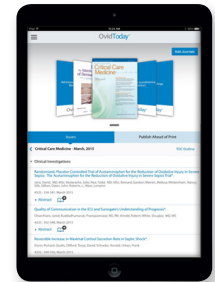
Browse journal content and read PDF articles